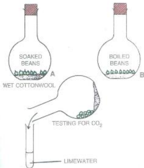
Experiment to show that germinating seeds produce carbon dioxide